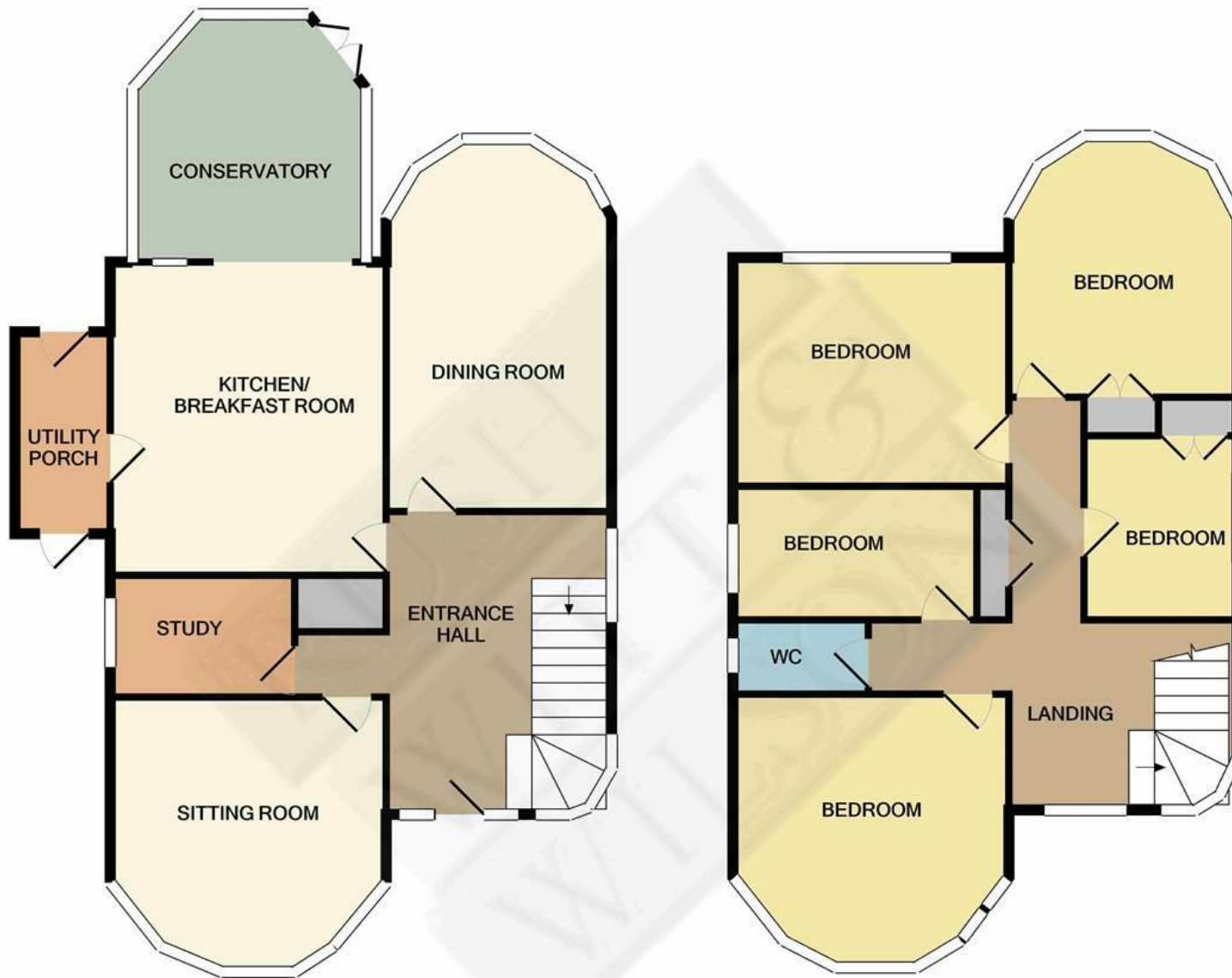
GROUND FLOOR APPROX. FLOOR AREA 796 SQ.FT. (73.9 SQ.M.)